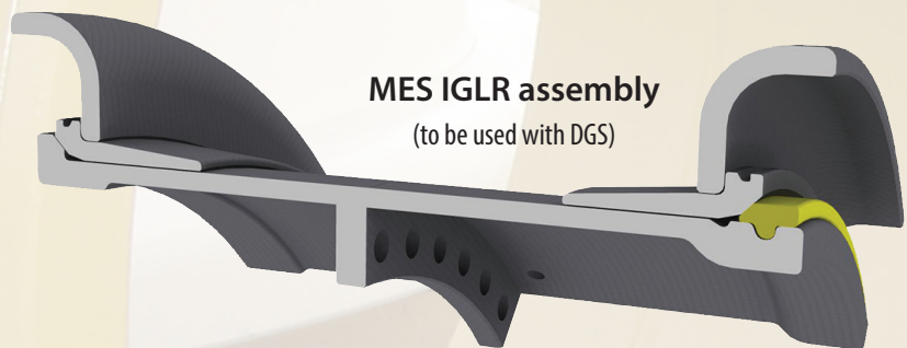
MES IGLR assembly (to be used with DGS)