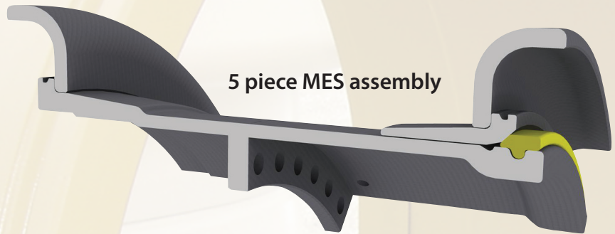
5 piece MES assembly